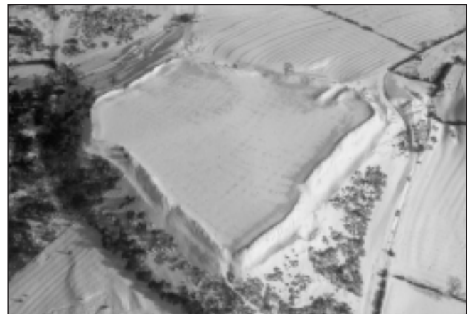
Fig. 6. The hillfort at Burrough Hill, near Twyford, Melton Mowbray.