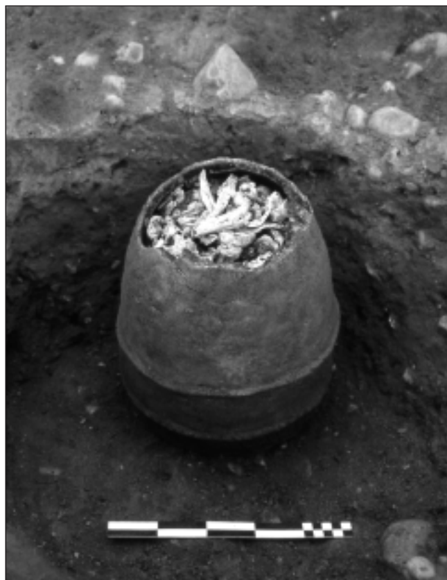
Fig. 2. Middle Bronze Age cremation urn during excavation of the large-scale cemetery at Eye Kettleby, Melton Mowbray.