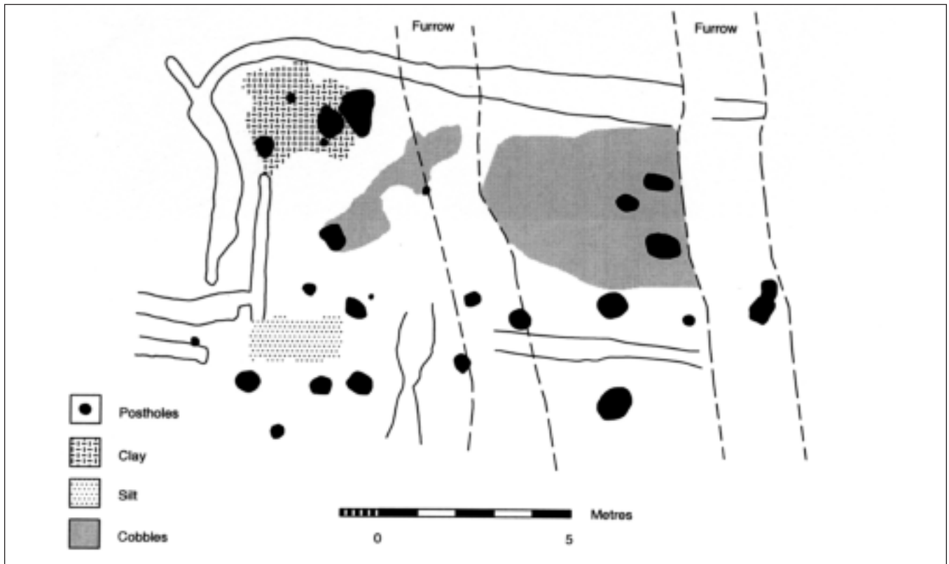
Fig. 3. A Late Bronze Age rectangular building at Eye Kettleby, Melton Mowbray (plan by N.Finn courtesy of University of Leicester Archaeological Services).

suggest some nearby cultivated or disturbed land. At Castle Donington similar environmental information from a Middle Bronze Age palaeochannel shows limited woodland and an increase in meadowland and pastureland species (A. Monckton pers. comm. ). The earliest evidence of spelt wheat is from charred remains from a Middle Bronze Age pit group at Lockington (c.1425-1260 Cal BC; Monckton 1995).