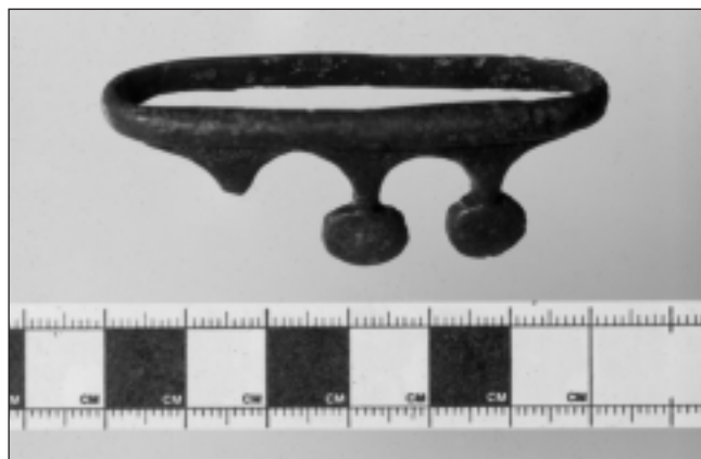
Fig. 7. A Late Iron Age copper alloy scabbard mouth from Normanton le Heath.

An example of a larger agglomerated lowland