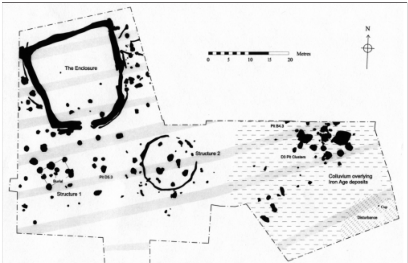
Fig. 4. Plan of the middle Iron Age site at Wanlip (from Beamish 1998).

A burnt mound consisting of heated pebble debris and an associated timber lined trough has been recorded at Watermead Park, Wanlip, adjacent to a timber bridge (Ripper 1997). Butchered cattle bones from adjacent palaeochannels at both this site and another from Castle Donington might suggest that cooking/feasting may have been taking place, although other alternative interpretations including saunas are suggested from similar sites in the West Midlands (Hodder and Barfield 1990). Two skulls were located within a palaeochannel deposit close to the burnt mound and timber bridge at Wanlip (Ripper 1997). One of the skulls has been radio-carbon dated to 990-830 CAL BC while cut marks on its atlas vertebra may indicate