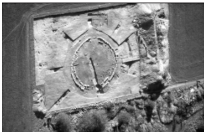
Fig. 1. Aerial view of the excavation of a multi-phase Bronze Age round barrow at Sproxton (north to the bottom). A sequence of concentric timber stake circles was later covered by a mound surrounded by two concentric stone kerbs. Finally material from an encircling ring ditch provided a stone capping. The trench seen running from the north towards the centre of the mound was excavated in 1860 by Thomas Bateman, and missed the central burial by 100mm (from Clay 1981).

Early Bronze Age pottery is known from several locations in Leicestershire and Rutland including examples of Beaker, Collared urn and food vessel. Metalwork has been recorded as stray finds or occasionally in association with other material, often in Beaker contexts.