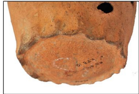
Three Views of a Potters Marston Jug Found in Stoney Stanton, Leicestershire.