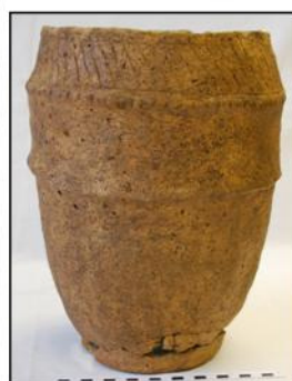
Cremation Urn from Eye Kettleby