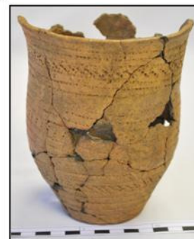
Neolithic/Bronze Age Urn from Smeeton Westerby