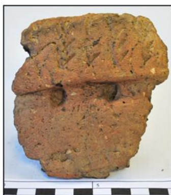
The sherd and an illustration of the vessel it came from