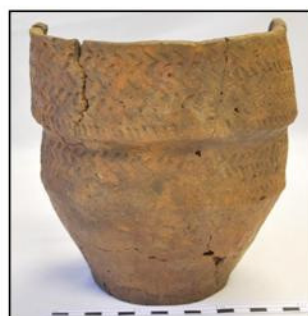
Bronze Age Collared Urn from Cossington, Leicestershire.