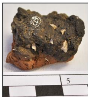
Neolithic sherd from Hallam Fields, Birstall, Leicestershire.

This pottery was coarse, coil built and fired in a bonfire at 600-700 degrees Centigrade.