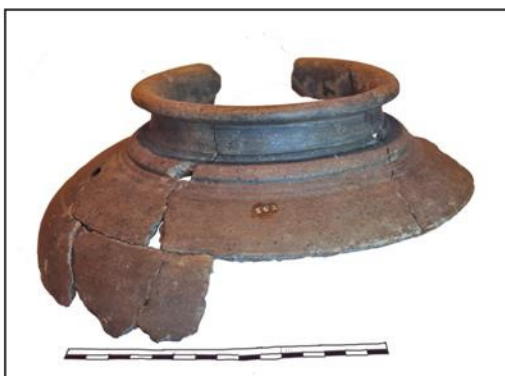
Large sherd and detail of its fabric

Both examples were found near Market Harborough. Similar course wares were manufactured in Northamptonshire and Bedfordshire.