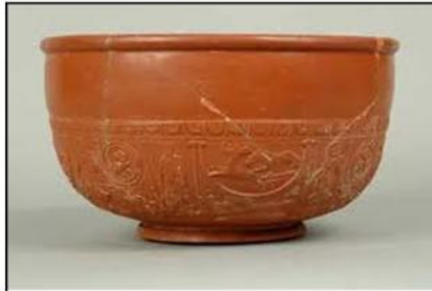
From the Shrewsbury Museum collection.

Samian Ware was high status table ware. The red-slipped bowls, dishes and cups were imported from Gaul. Red colour-coated beakers were also imported from there and the Rhineland. Romano-British potteries (i.e. British potteries producing Roman-style pots) also made their versions of these items.